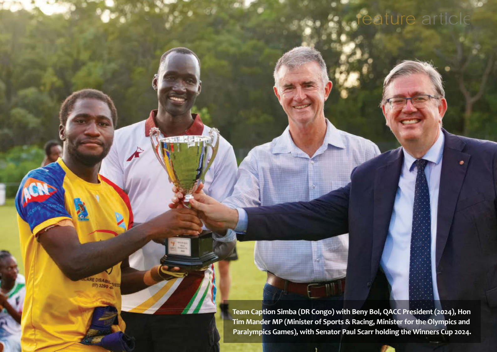
Team Caption Simba (DR Congo) with Beny Bol, QACC President (2024), Hon Tim Mander MP (Minister of Sports & Racing, Minister for the Olympics and Paralympics Games), with Senator Paul Scarr holding the Winners Cup 2024.